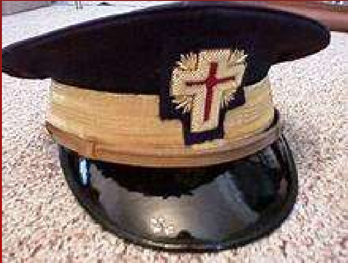
Pershing Cap with gold band and gold chin strap for Past Commanders and Grand Officers and a Silver band and silver chin strap for Sir Knights.