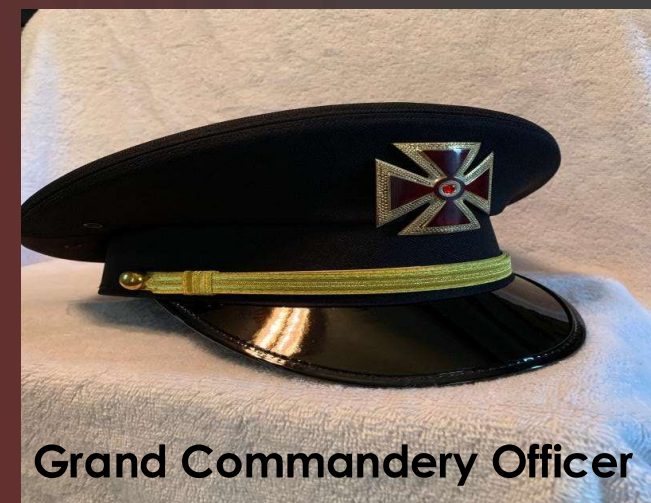
Grand Commandery Officer