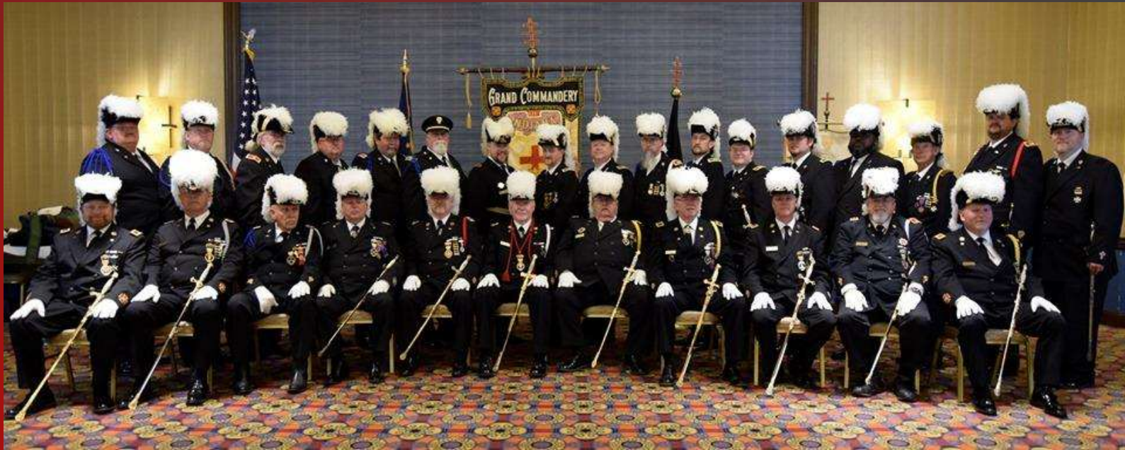
Grand Commandery 2019