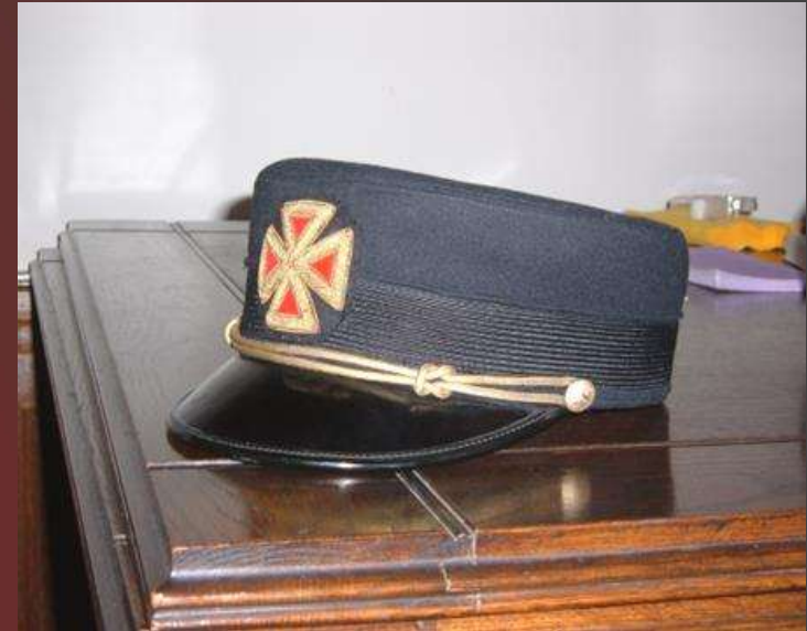
Bell Crown Cap with gold band