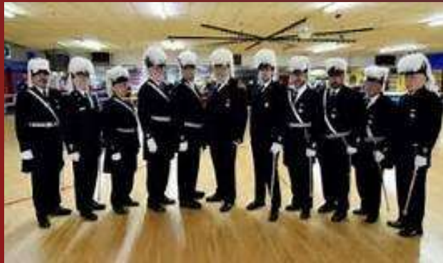
Raper Commandery Drill Team